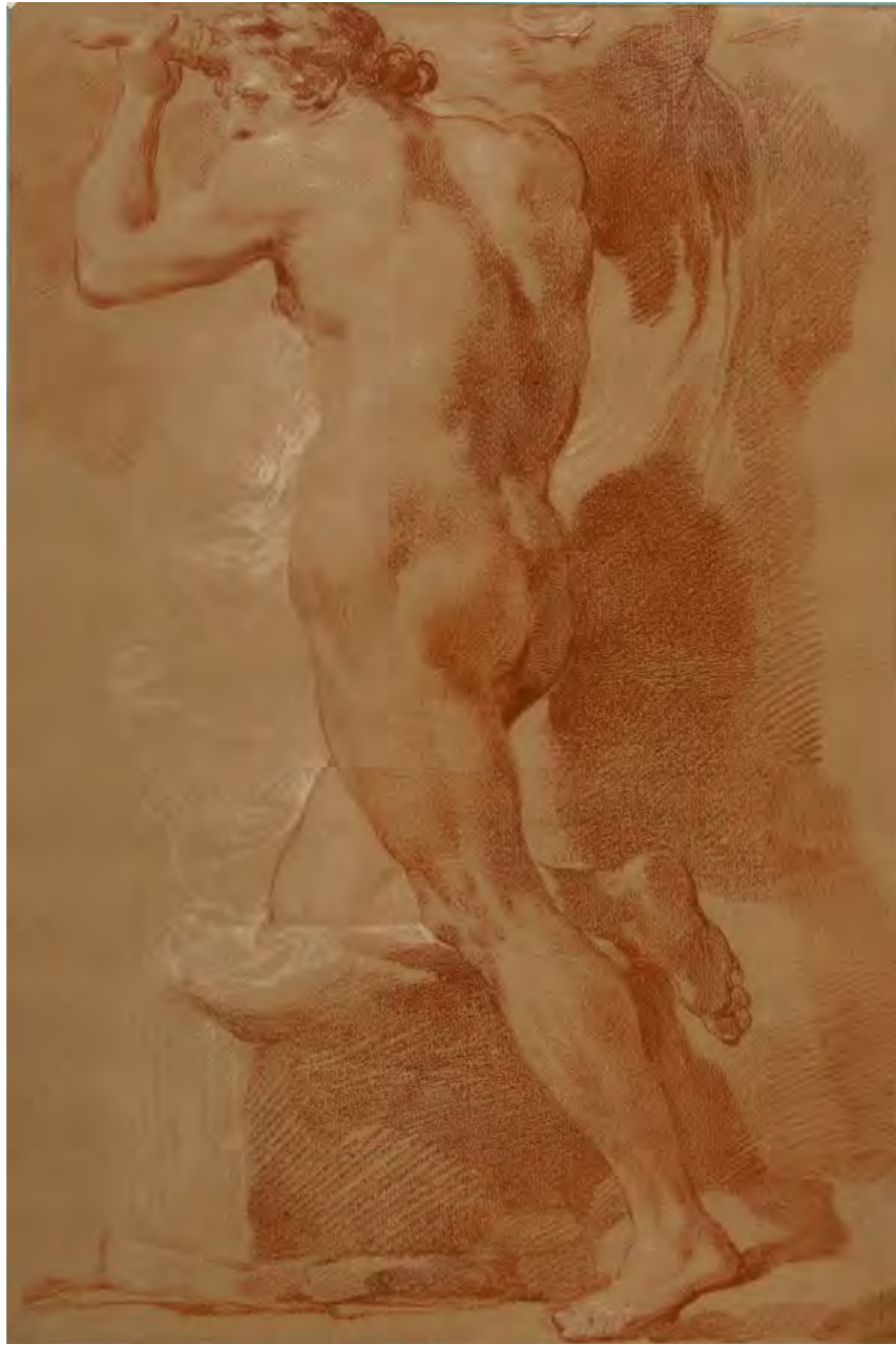
Fig. 5: Ubaldo Gandolfi, Standing Male Nude seen from behind , red pencil on parchment, heightened with white, 28.6 x 42.9 cm, Harvard Art Museums

In this connection we may profitably look at the Male Nude seated on a rock , an extremely fine study in which the observer's gaze is drawn from the foot in the foreground to the oratorical gesture of the hand, and in which the young model's concentrated expression plays a crucial role in transforming a simple academic pose into a narrative element. Or the Male Nude seen from behind in a three-quarter pose , in which the skilled handling of light imparts immediacy and truth to a pose that would otherwise have been focused on rendering the figure's muscle structure.