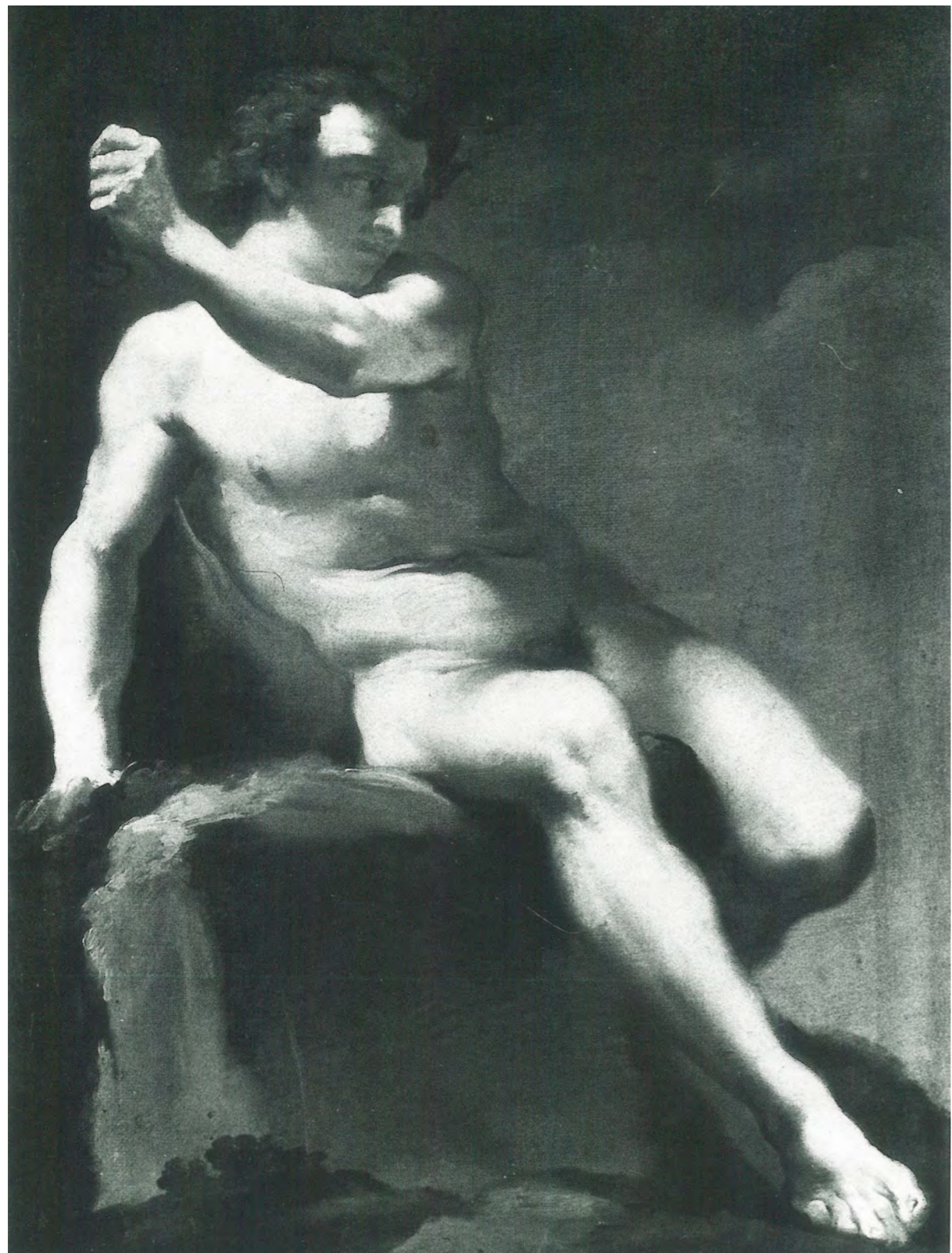
Fig. 1: Ubaldo Gandolfi, Male nude , oil on canvas, 75.7 x 53.6 cm, Marano di Castenaso (Bologna), Molinari Pradelli collection

Never tiring of tackling the difficulties inherent in the study of subjects from life, Ubaldo began to exercise his skill in this field in his formative years and was to pursue it throughout his long career, following the teachings of certain crucial