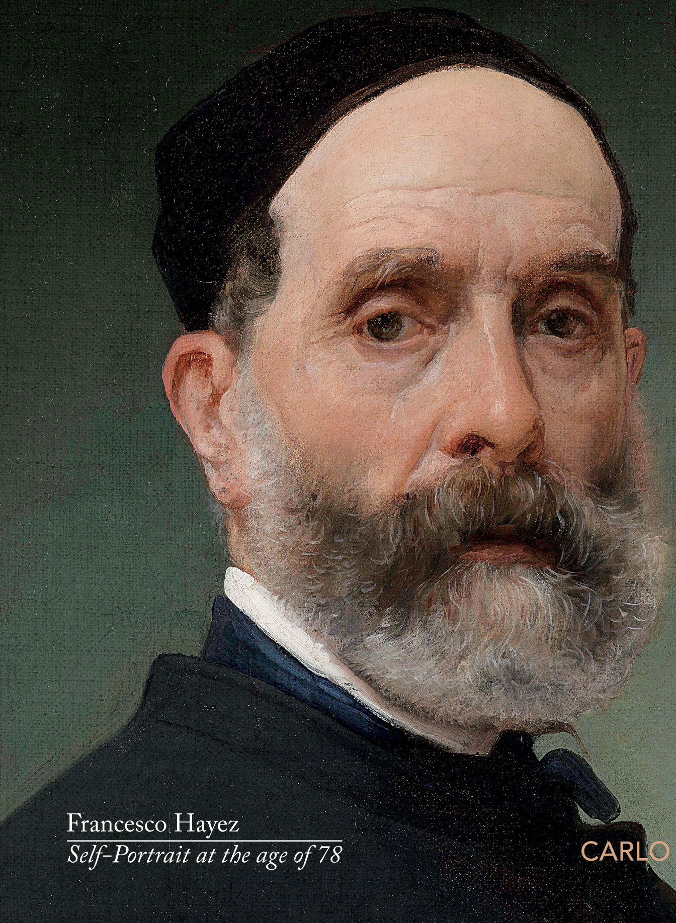
Francesco Hayez Self-Portrait at the age of 78