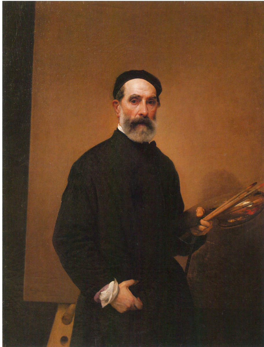
Fig. 1: Francesco Hayez, Self-Portrait at the age of 71 , Florence, Gallerie degli Uffizi

emerging from the cuff of his shirt sleeve all point, in particular, to the version in Venice. The choice of a close-up view and the absence of the canvas behind him, however, have allowed the painter, in avoiding all reference to his atelier , to focus on capturing his own facial features both in their physical characteristics,