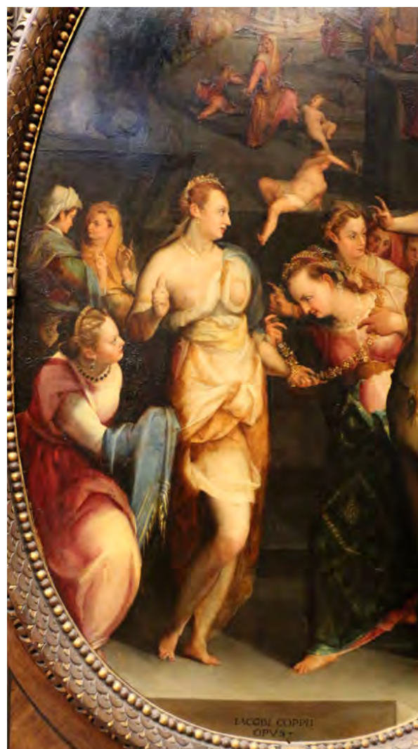
Fig.2: Jacopo Coppi, in Darius' Family Before Alexander the Great , (detail). Florence Palazzo Vecchio, Studiolo of Francesco I

Coppi painted a multitude of male heads with markedly individual features (a high forehead, a pointed nose, slanted eyes or claw-like hands inspired by the style of Rosso Fiorentino) in his Ecce Homo in Santa Croce and in the Miracle of the Crucifix of Beirut for the church of San Salvatore in Bologna, and these features may serve as a guide in identifying the artist's free-standing