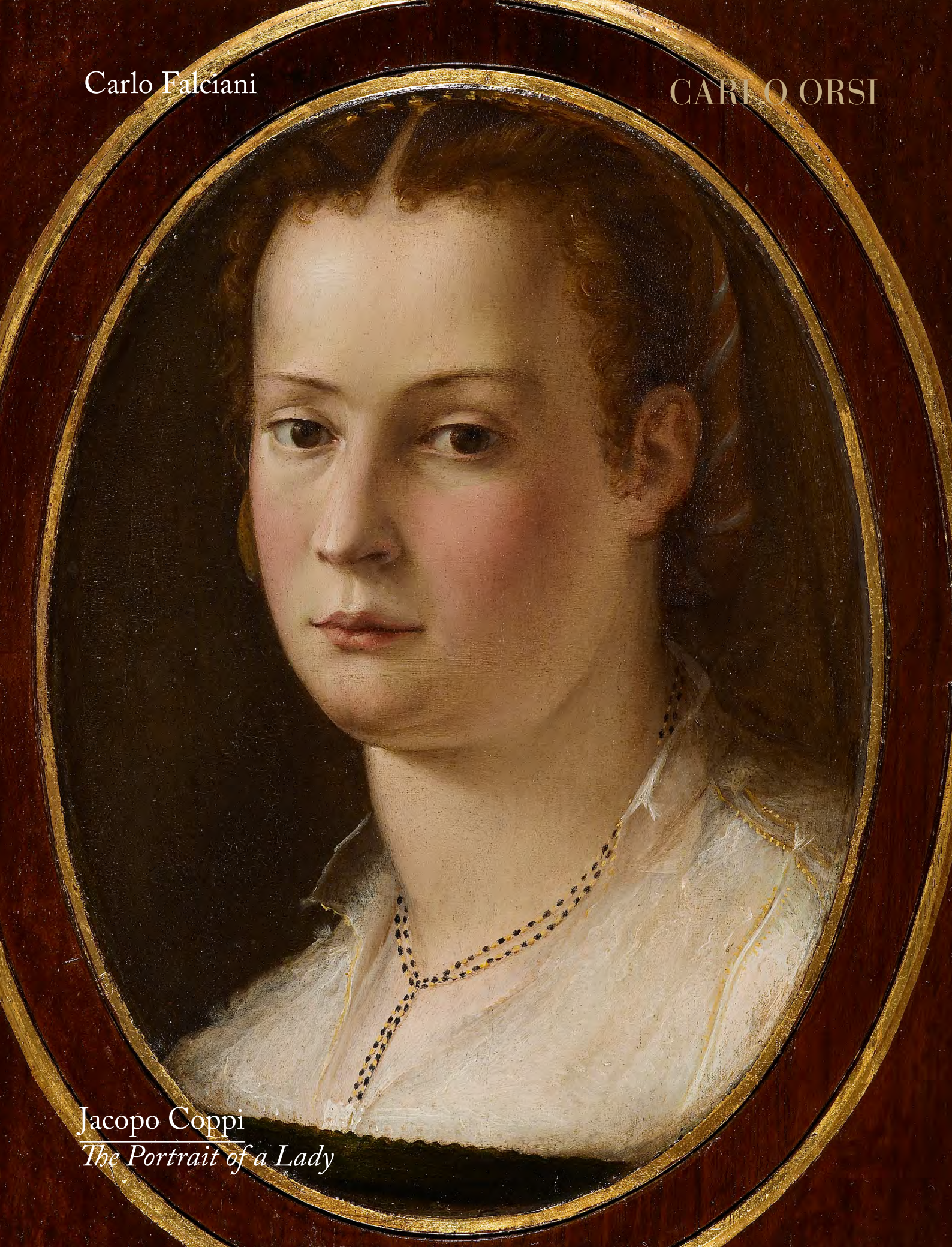
Jacopo Coppi The Portrait of a Lady