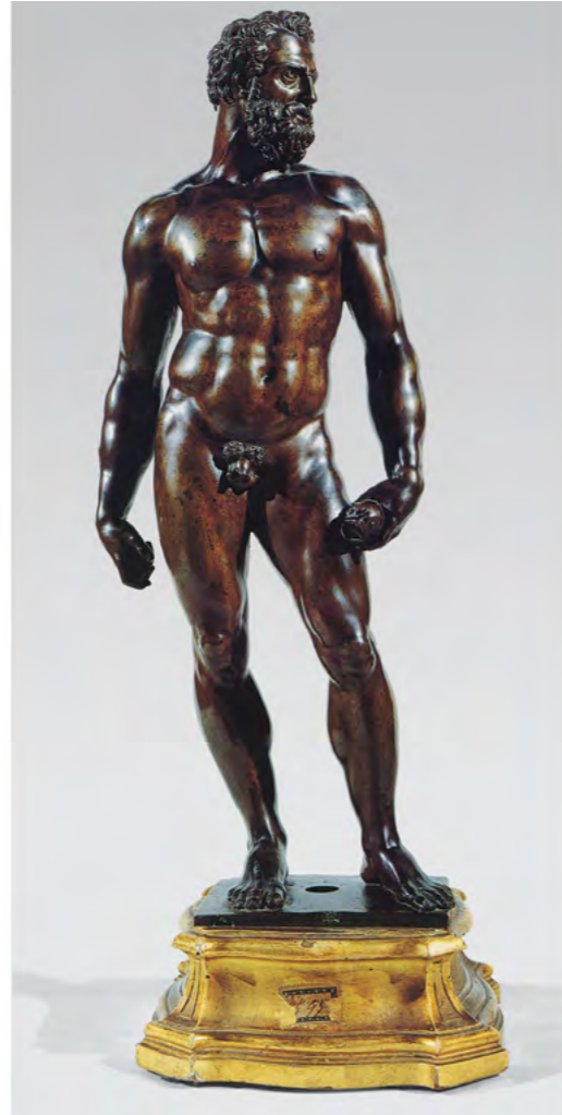
Fig. 2: After Baccio Bandinelli, Neptune , bronze, height 52 cm, Rome, Galleria Colonna

The autograph nature of the work is borne out yet further – if indeed any